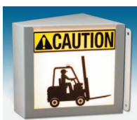
small sign forklift