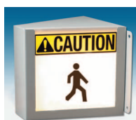
small sign pedestrian